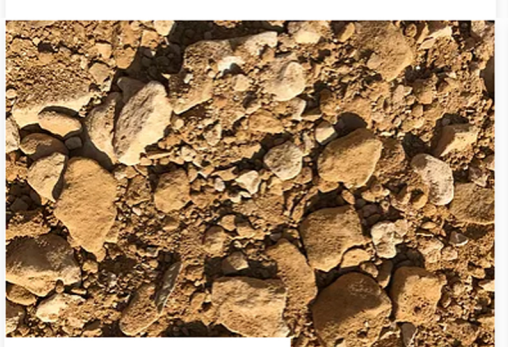
50mm DOWN LIMESTONE Loose tip/ Yard collect